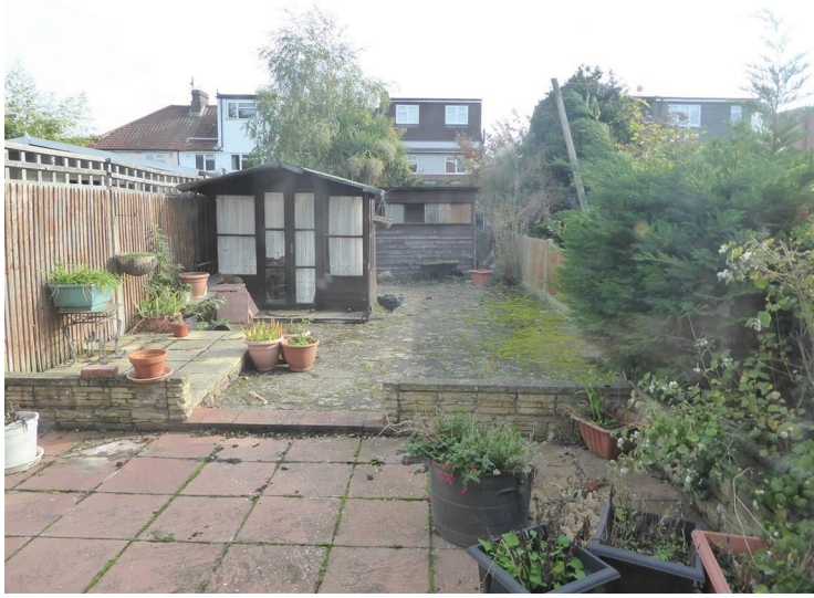
Side access, paved patio area, further concrete paved area, summer house and storage shed.